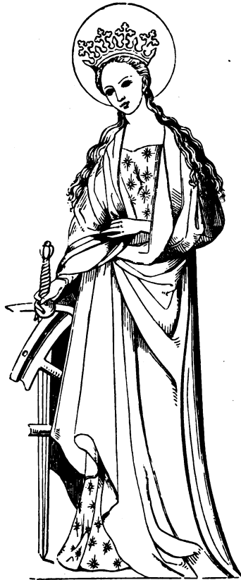
S. Katharine ( Lucas and Leyden ).